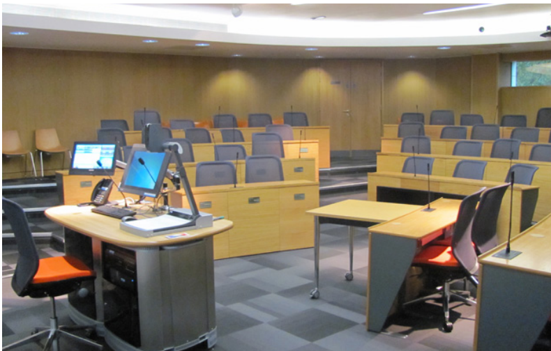
Bateman Lecture Theatre Building One 1 st Floor