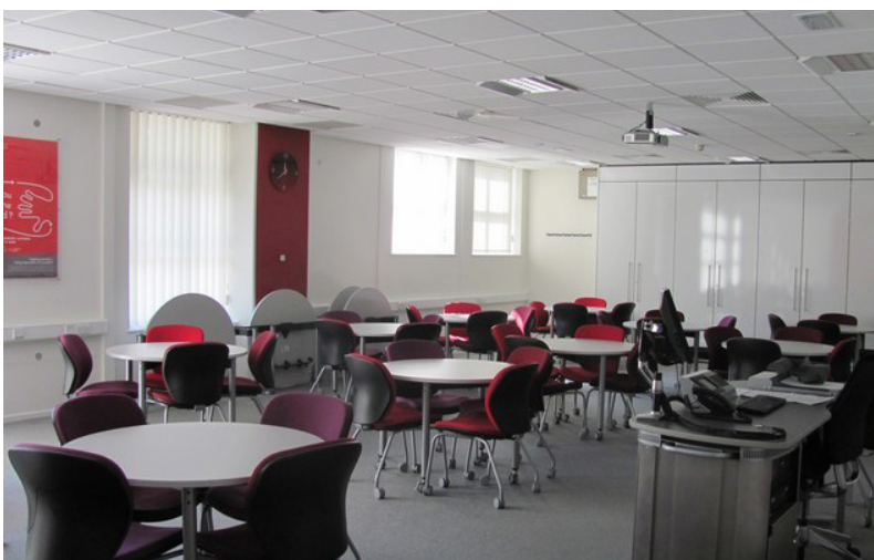
Room SC028 Streatham Court Ground Floor