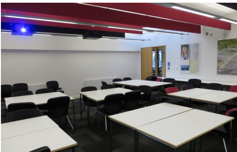
Kolade Teaching Room Building One 2 nd Floor